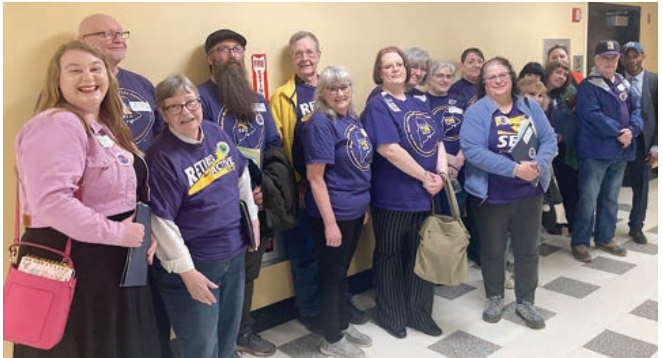
MSEA-SEIU members on March 7 pack the State and Local Government Committee's work session on LD 2121, legislation to close the state employee pay gap. We're pleased that the portion of the legislation authorizing the Mills administration to use the Salary Plan to address pay gap was included in the Supplemental Budget (LD 2214 ) that Governor Mills signed into law, but are disappointed that the other provisions of LD 2121 weren't enacted into law.